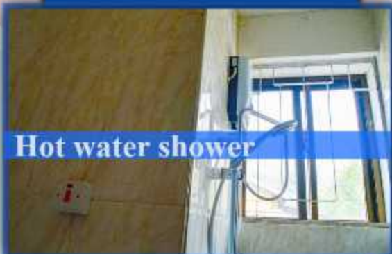
Hot water shower